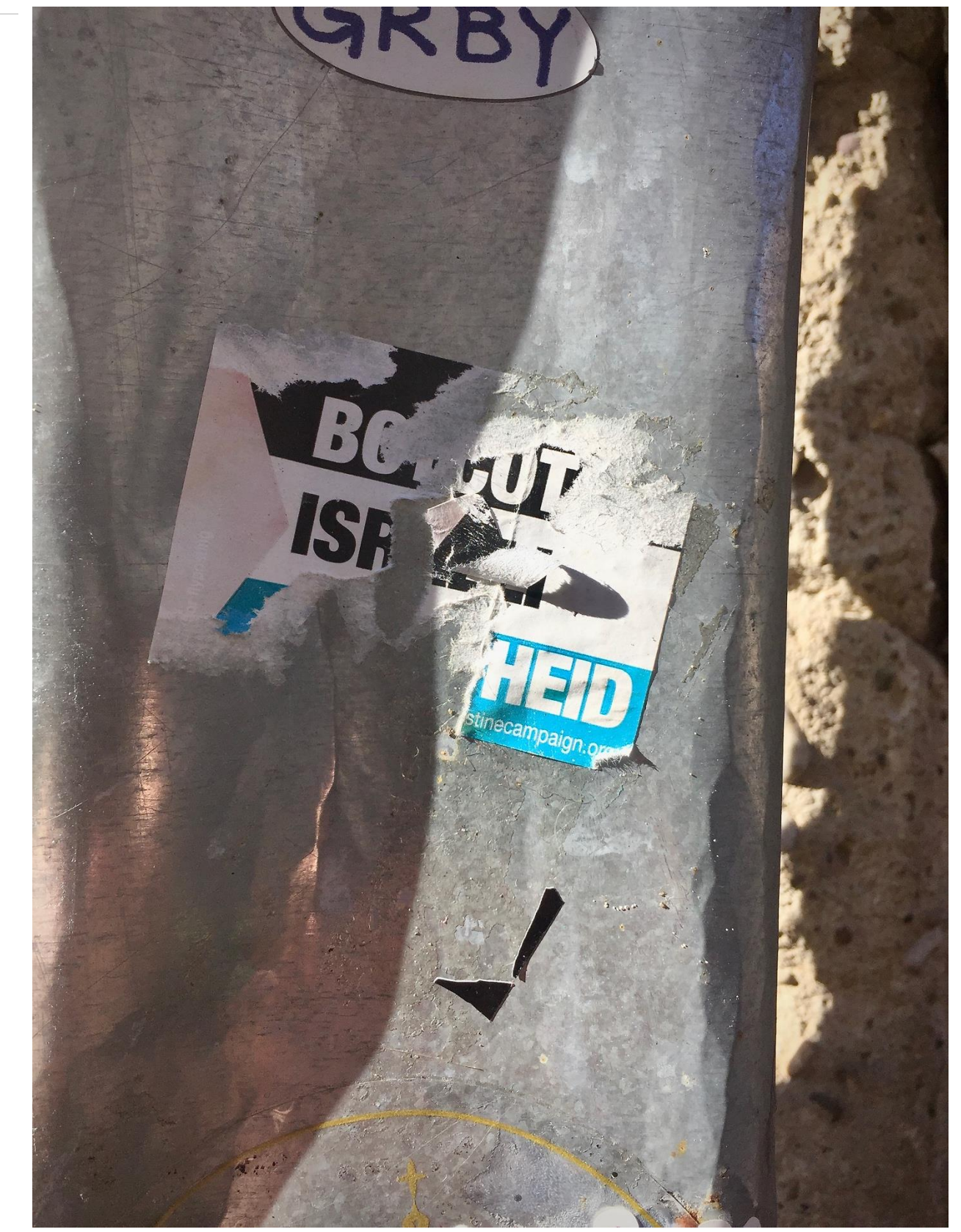
lmage 6 – (2019) Kaptol, Zagreb