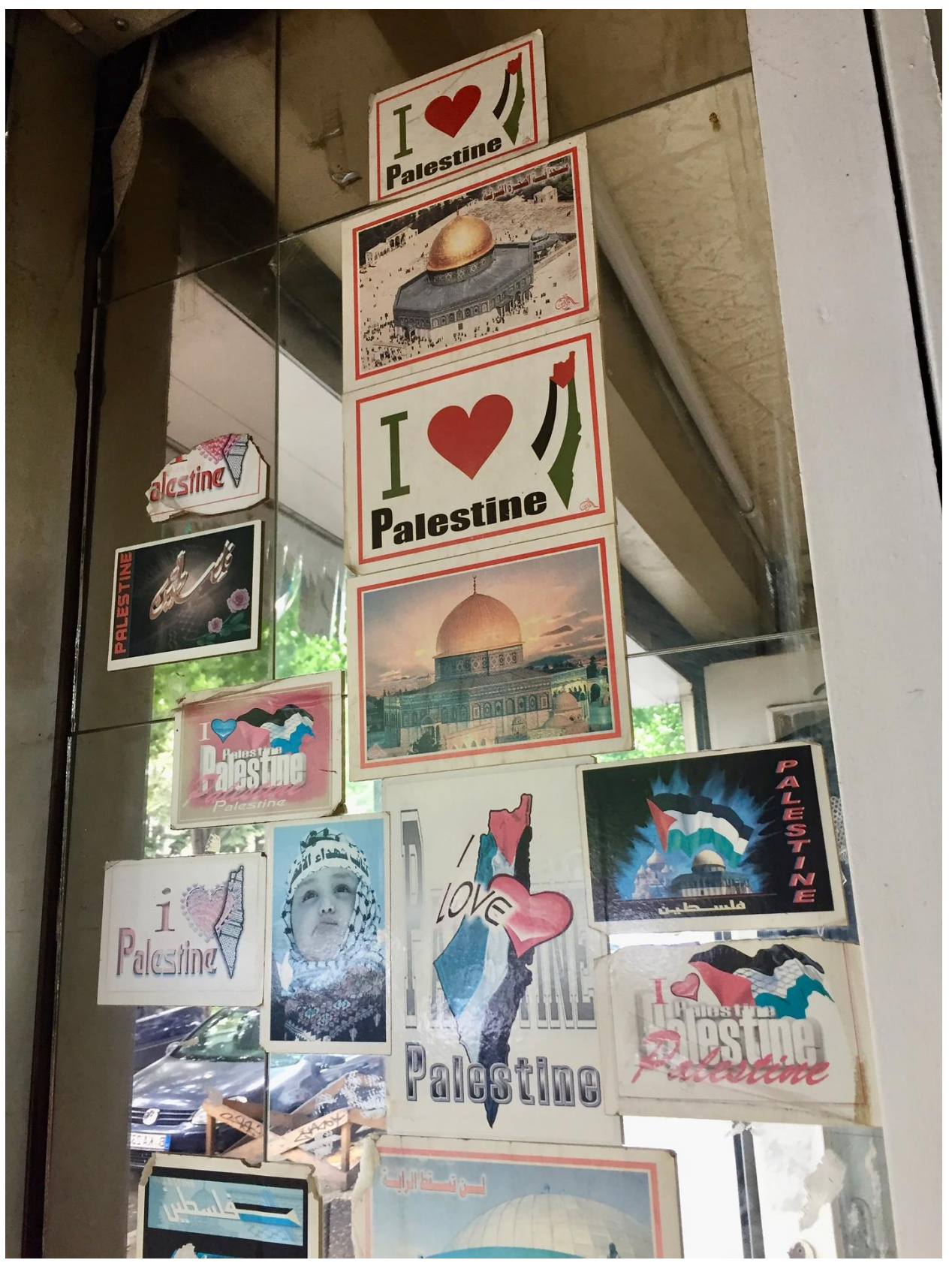
lmage 7 – (2018) Neukölln, Berlin