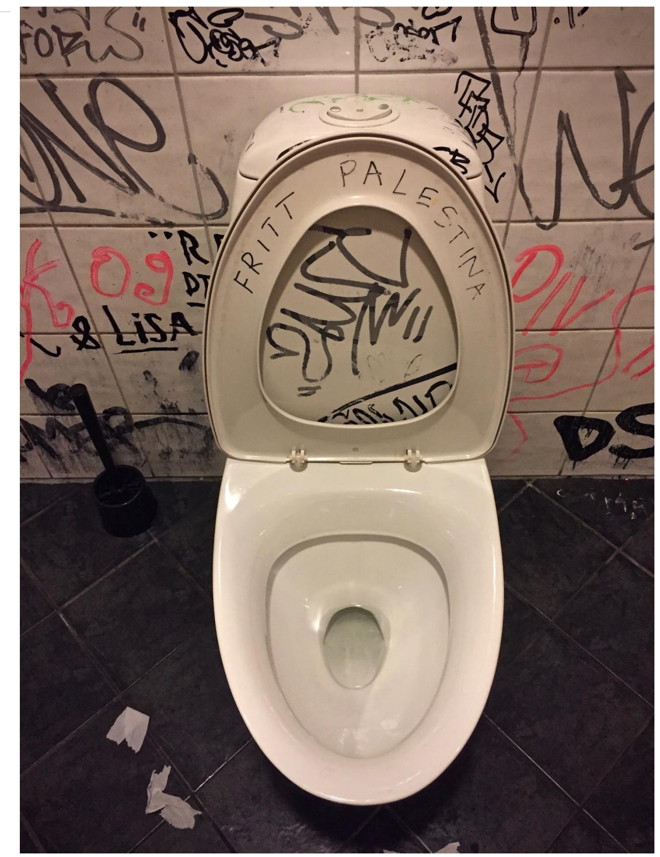
lmage 8 – (2018) Grüherløkka, Oslo