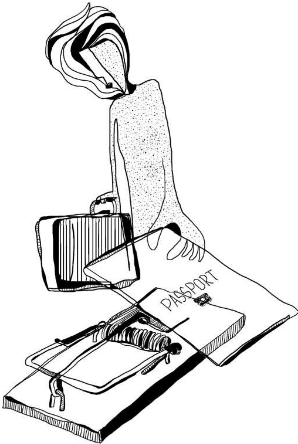
"Take it or leave it." The borders trap. [1/3 The Human Trap]