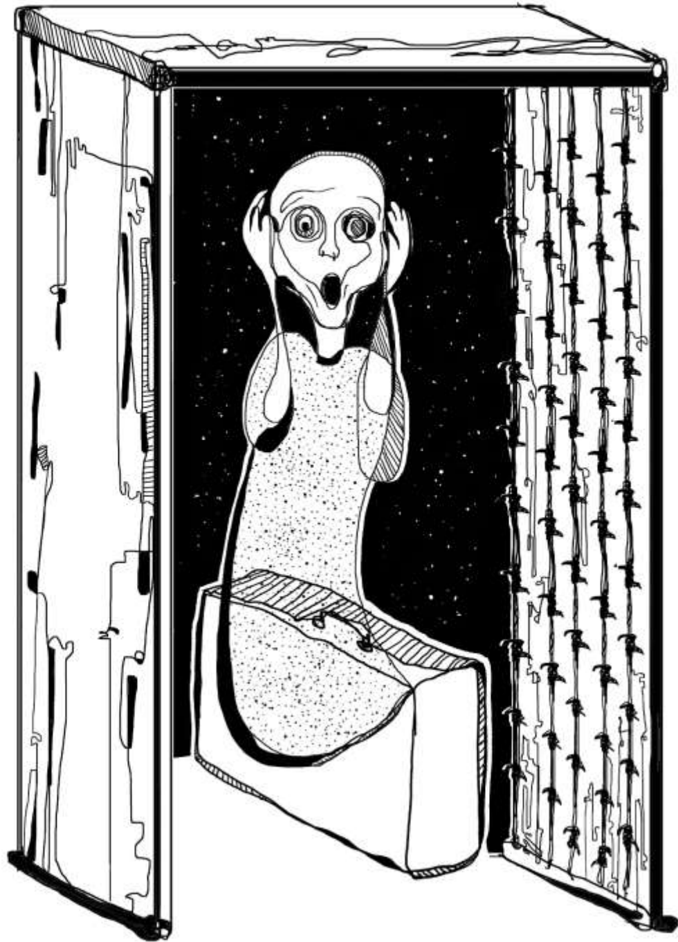
"Aliens are not welcome." The new scream. [3/3 The Human Trap]