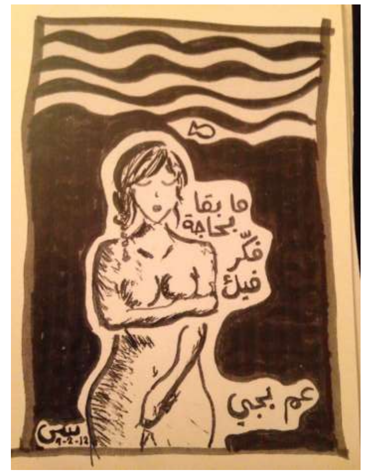
One of Sarag's postcards